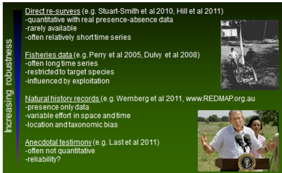
Fig. 3 Four evidence-based approaches to the detection of single-species range shifts in marine systems.