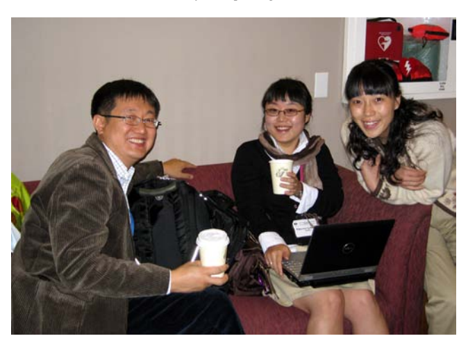
Early career marine scientists from Korea.