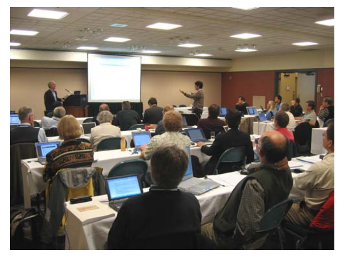
Enthusiastic discussion at the well-attended the FISP Workshop.